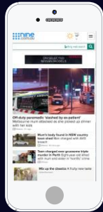
7am – Catches up on the latest news on Nine.com.au .