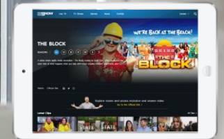
Evening – Catches up on The Block on 9Now with housemates.

Interior Designers are professionals who work in finance, media and technology, and rent in Inner City suburbs. They earn above average incomes and are predominately mobile and 9Now users. They typically rent apartments and spend to ensure that their place is looking on-trend. They buy furnishings that they can move from one rental to another.