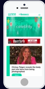
Travelling to work - Checks out the latest entertainment news on 9Honey .