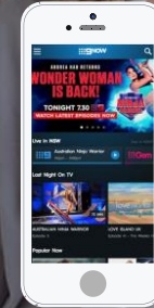
Journey home - Quick flick through 9Now to plan nightly viewing.